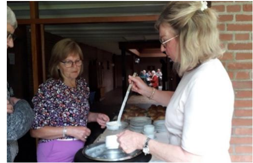
The traditional asparagus soup should not be missed