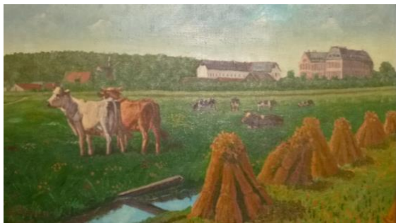
Former St. Paul until around 1970