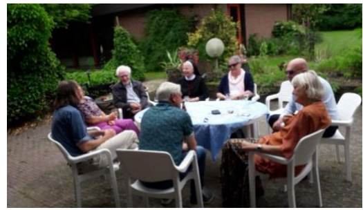
Old and new memories are recalled